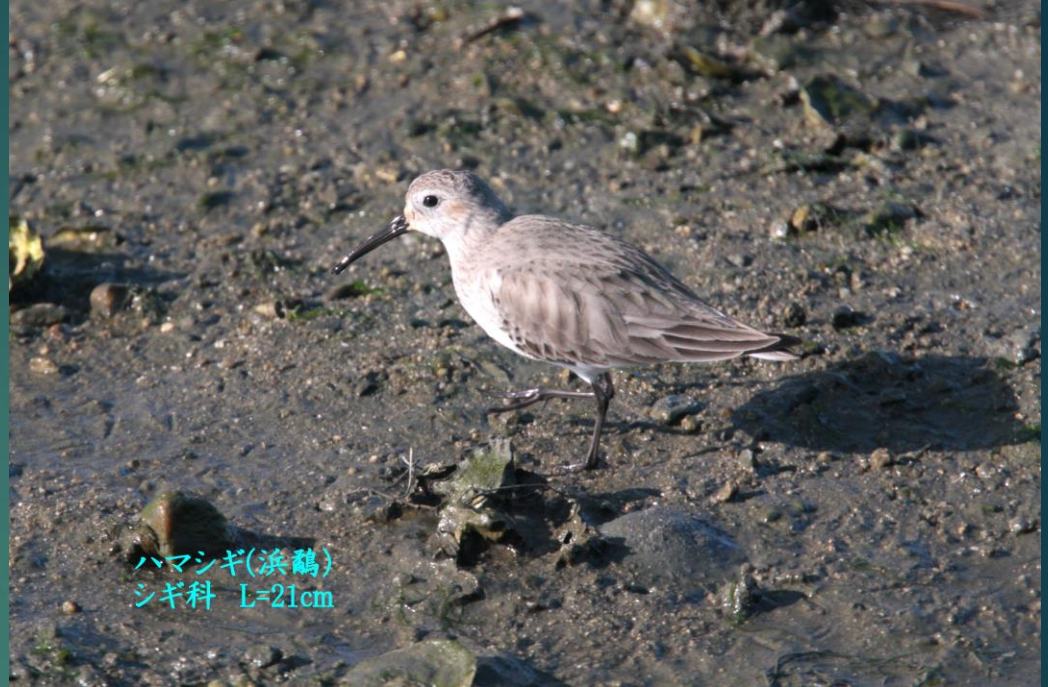
ハマシギ(滨鹬) シギ科 L=21cm