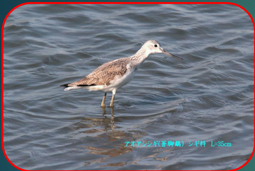
アオアシシギ(蒼脚鷗) シギ科 L=35cm