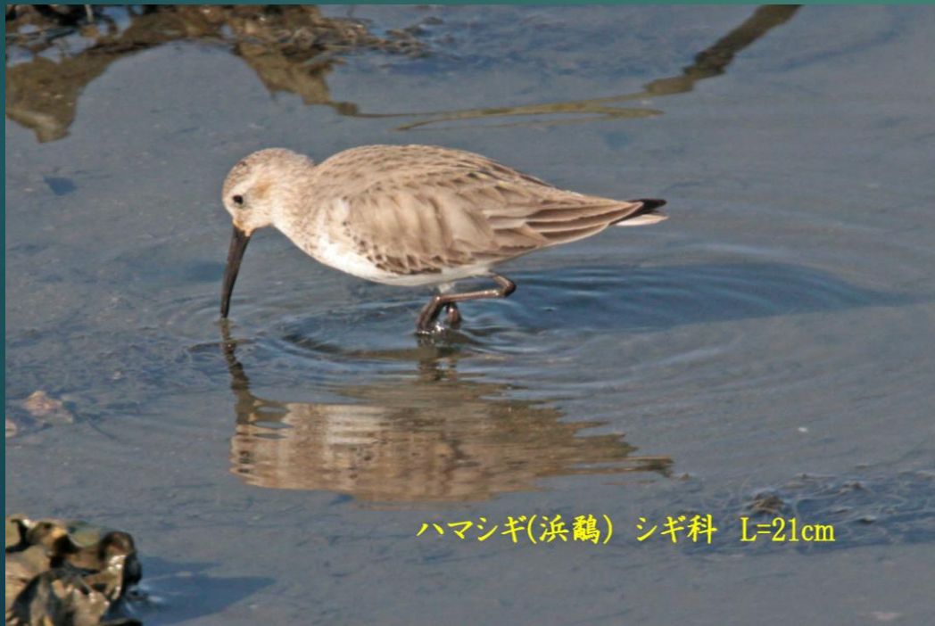
ハマシギ(滨鹬) シギ科 L=21cm