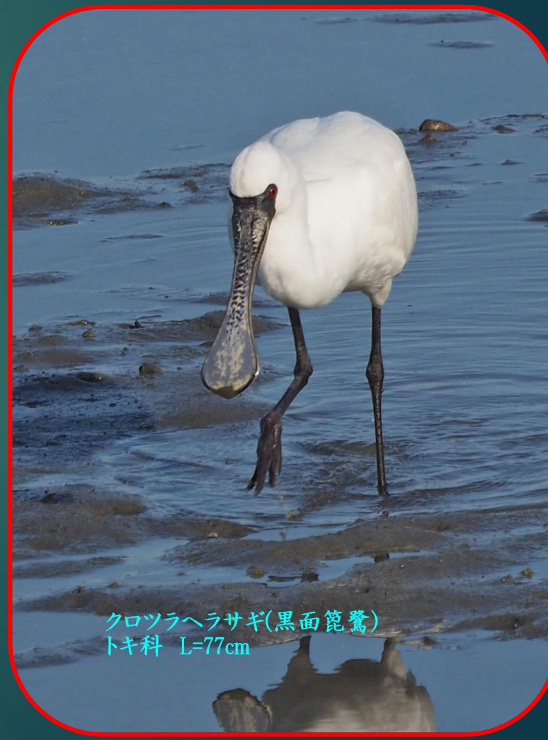
クロツラヘラサギ(黒面篋鷺) トキ科 L=77cm