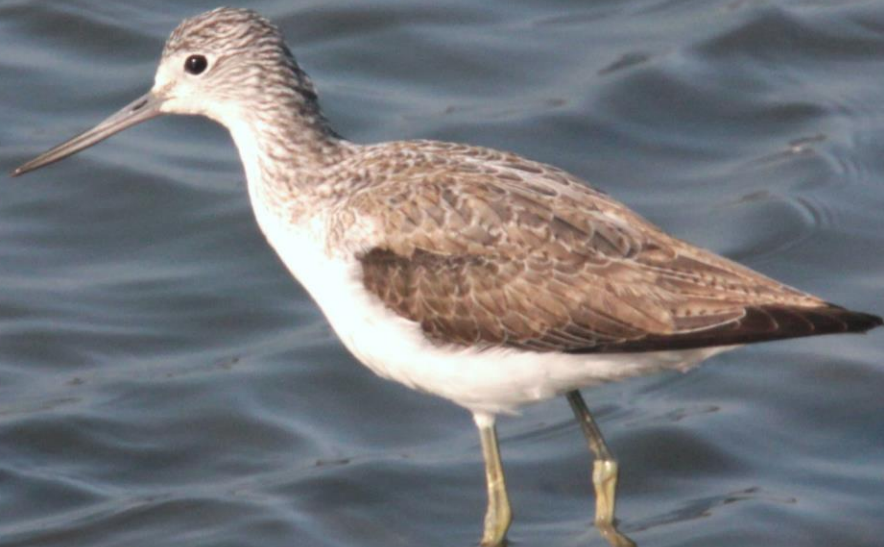
アオアシシギ(蒼脚鷸) シギ科 L=35cm