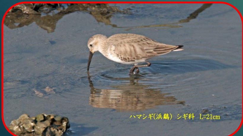
ハマシギ(浜鷗) シギ科 L=21cm