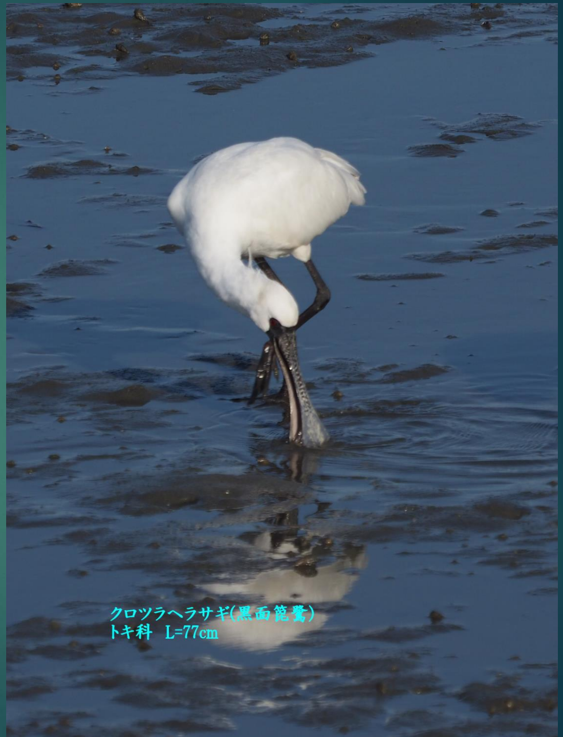
クロツラヘラサギ(黒面篋鷺) トキ科 L=77cm