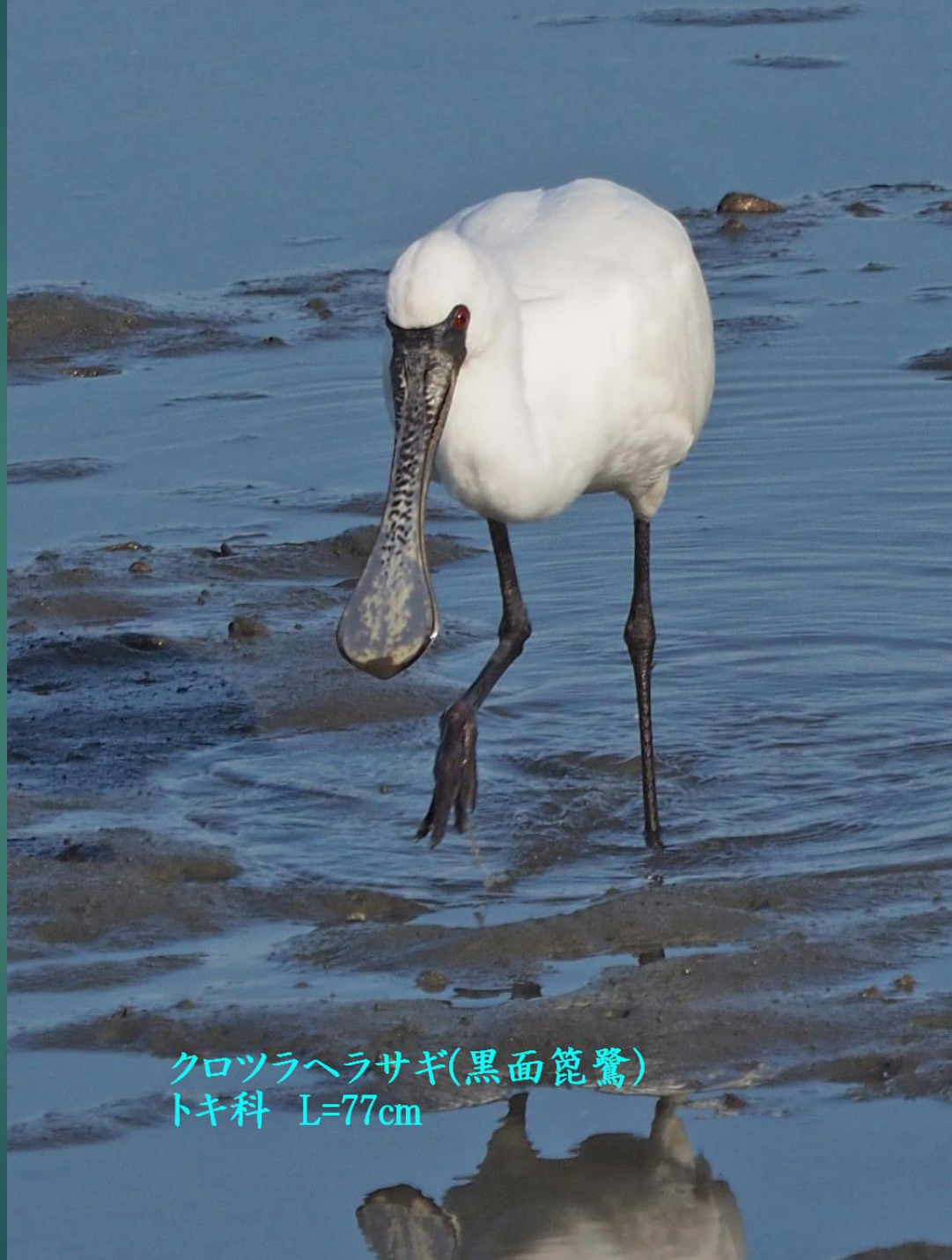
クロツラヘラサギ(黒面篋鷺) トキ科 L=77cm