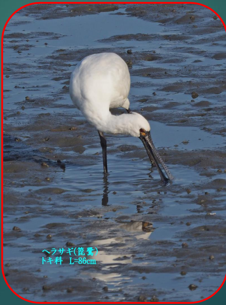
ヘラサギ(篋鷺) トキ科 L=86cm