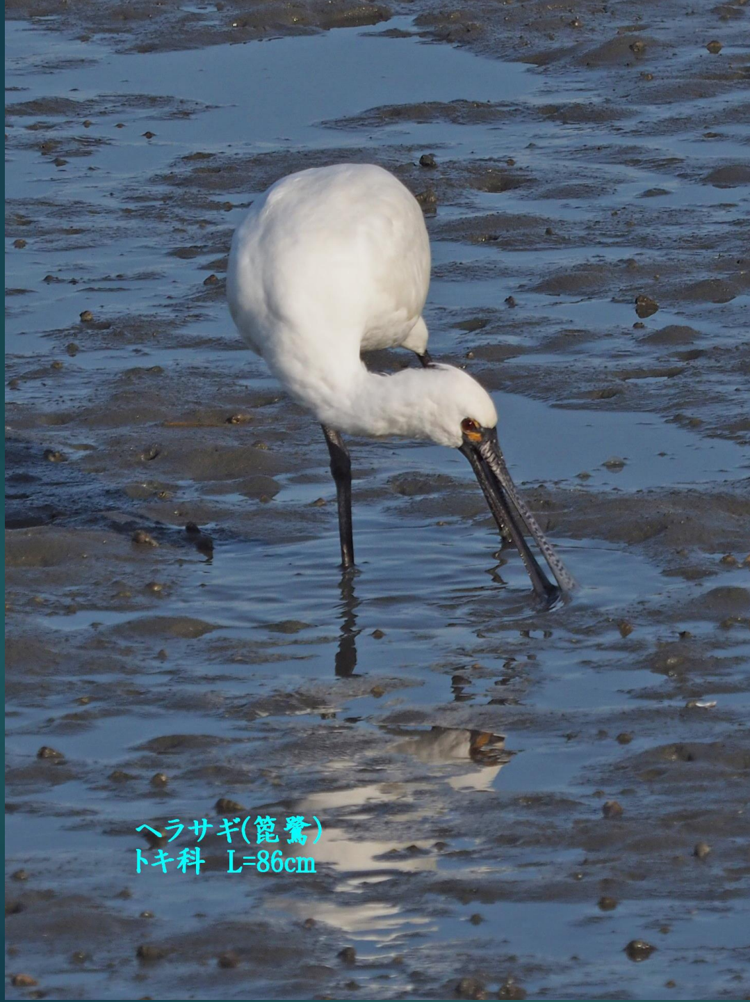
ヘラサギ(篋鷺) トキ科 L=86cm