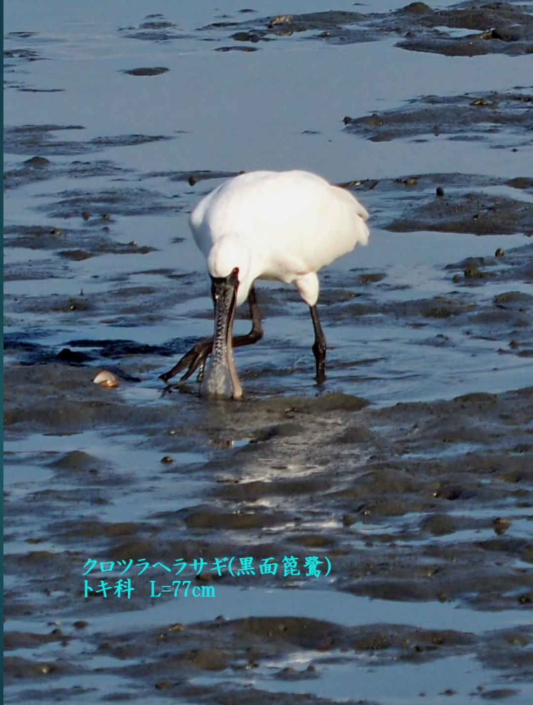
クロツラヘラサギ(黒面篋鷺) トキ科 L=77cm