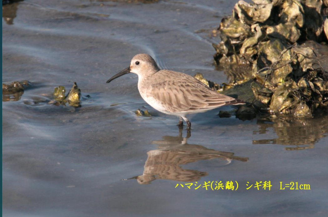
ハマシギ(滨鹬) シギ科 L=21cm