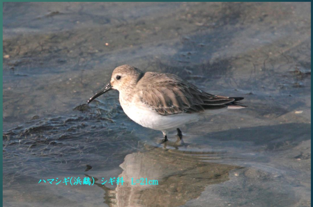
ハマシギ(滨鹬) シギ科 L=21cm