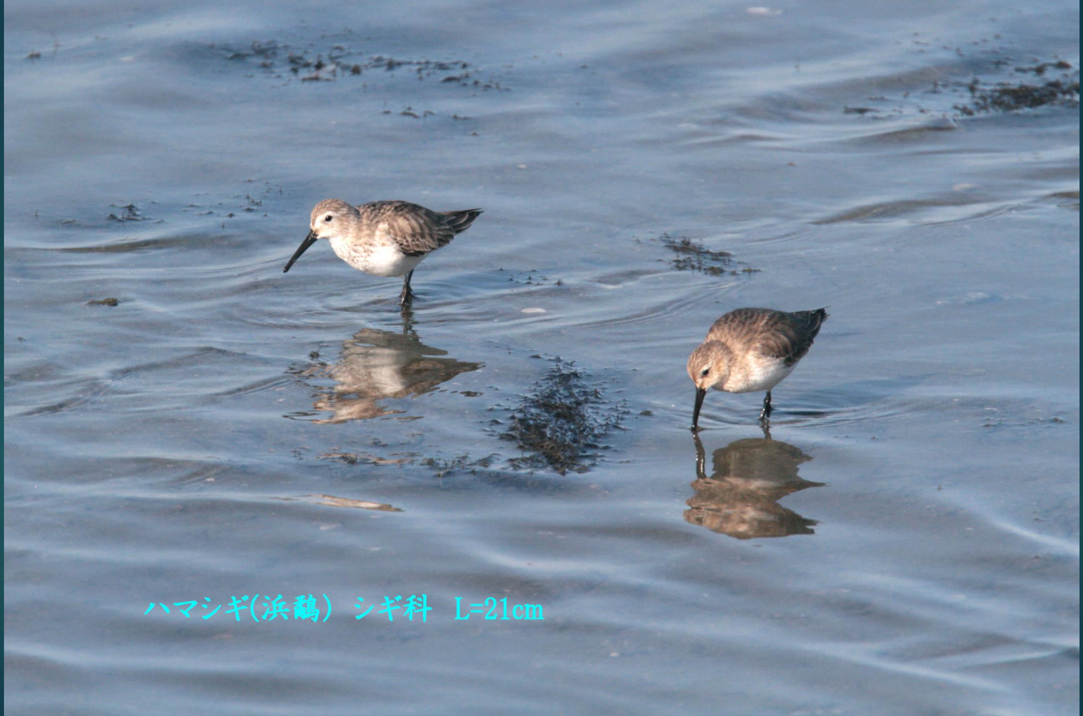
ハマシギ(滨鹬) シギ科 L=21cm