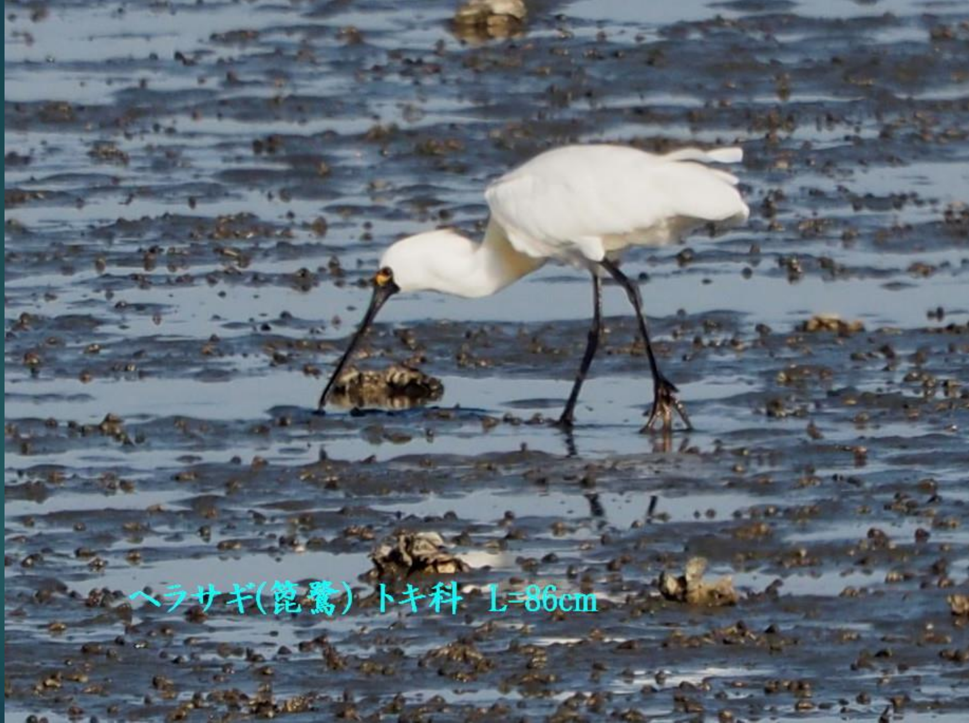
ヘラサギ(篋鷺) トキ科 L=86cm