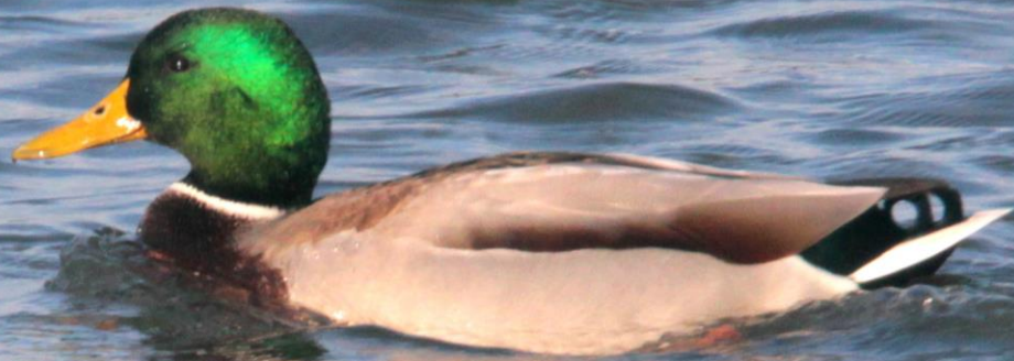
マガモ(真鴨)オス ガンカモ科 L=59cm