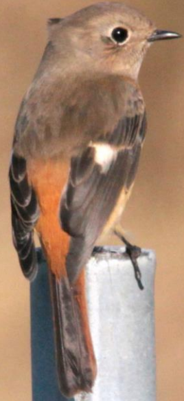
ジョウビタキ(尉鷓)メス ヒタキ科 L=14cm