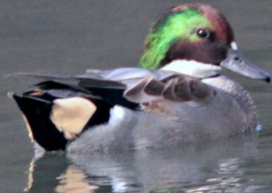
ヨシガモ(葦鴨)オス ガンカモ科 L=48cm