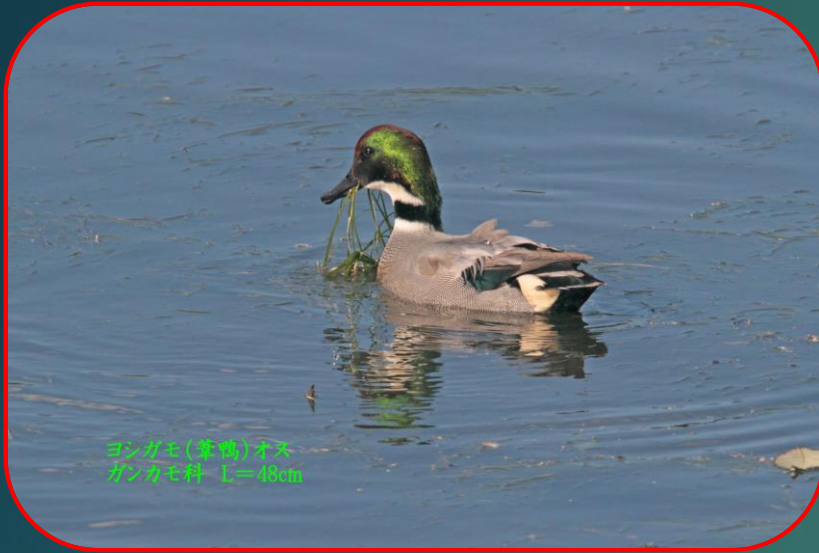
ヨシガモ(葦鴨)オス ガンカモ科 L=49cm