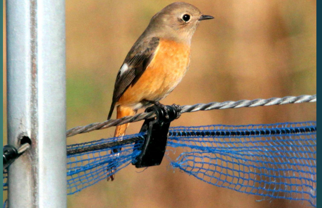
ジョウビタキ(尉鷓)メス ヒタキ科 L=14cm