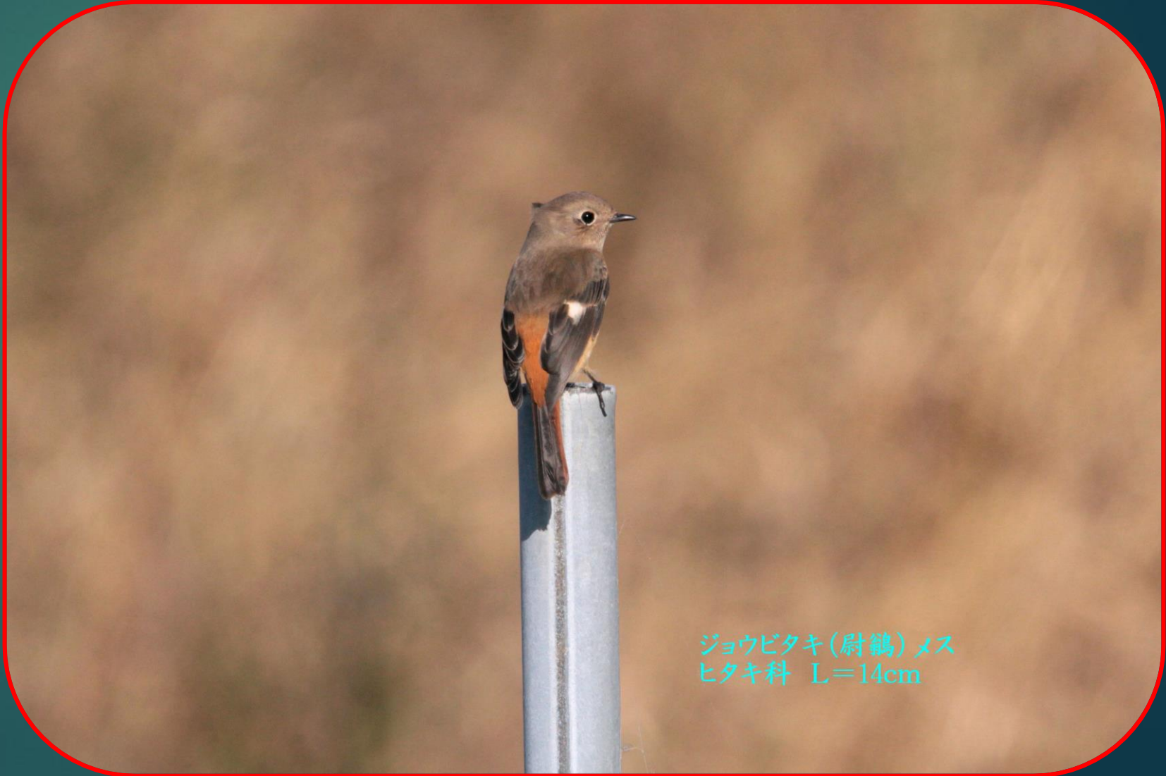
ジョウビタキ(尉鶺)メス ヒタキ科 L=14cm