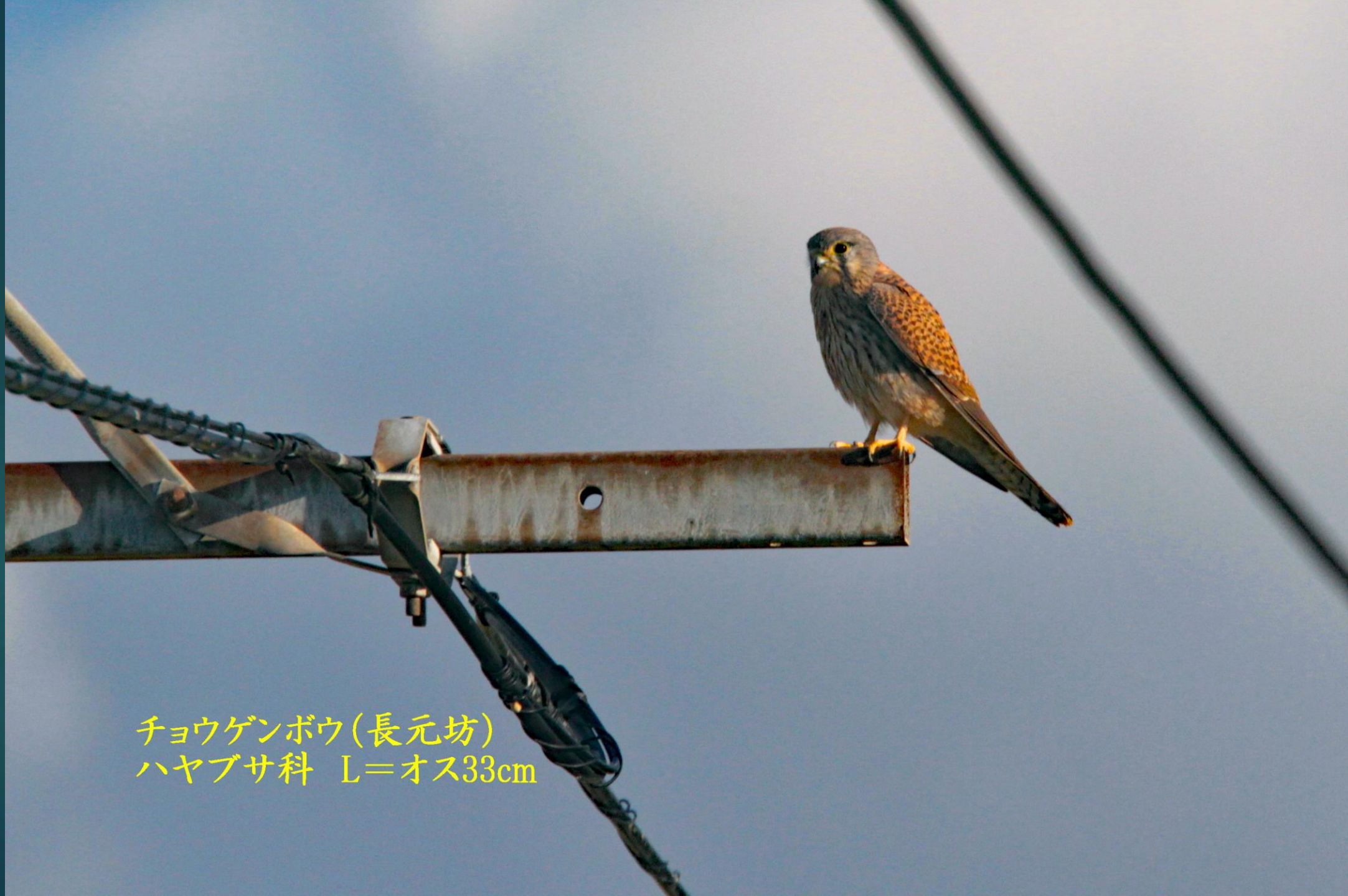
チョウゲンボウ(長元坊) ハヤブサ科 L=オス33cm