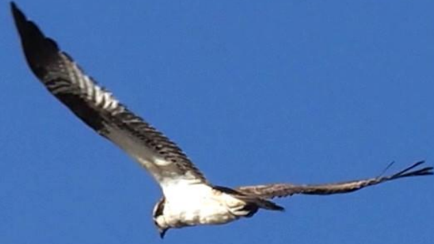
ミサゴ(鷗) ワシタカ科 L=メス64cm