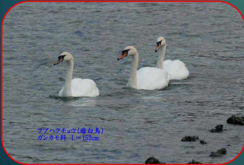
コブハクチョウ(瘤白鳥) ガンカモ科 L=152cm