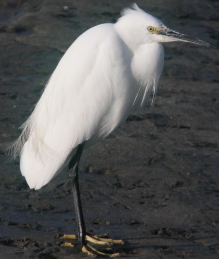
コサギ(小鷺) サギ科 L=61cm