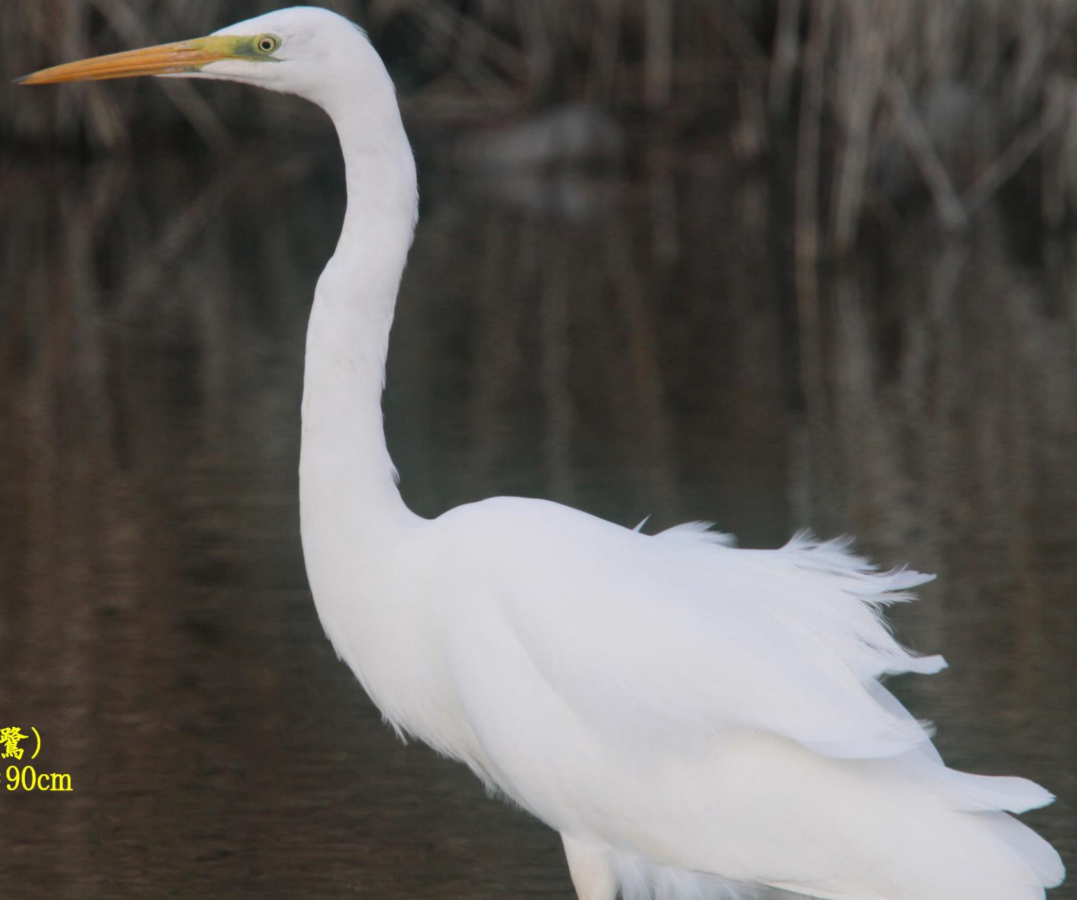
ダイサギ(大鷺) サギ科 L=90cm