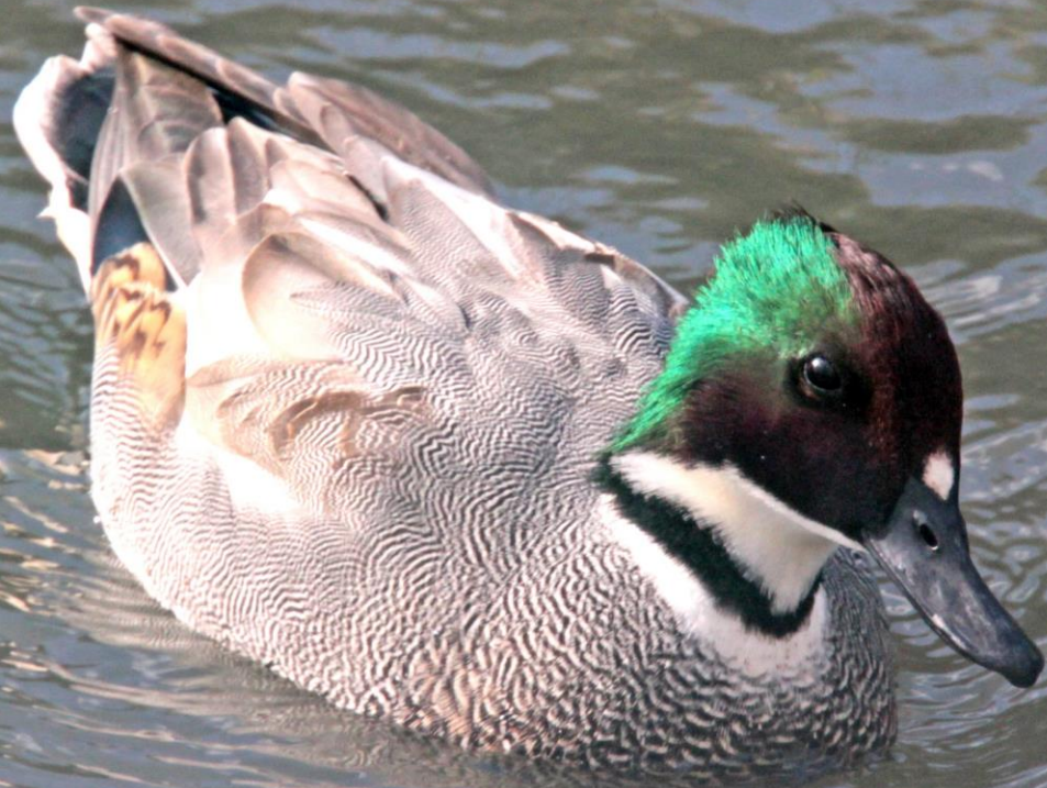
ヨシガモ(葦鴨)オス ガンカモ科 L=48cm