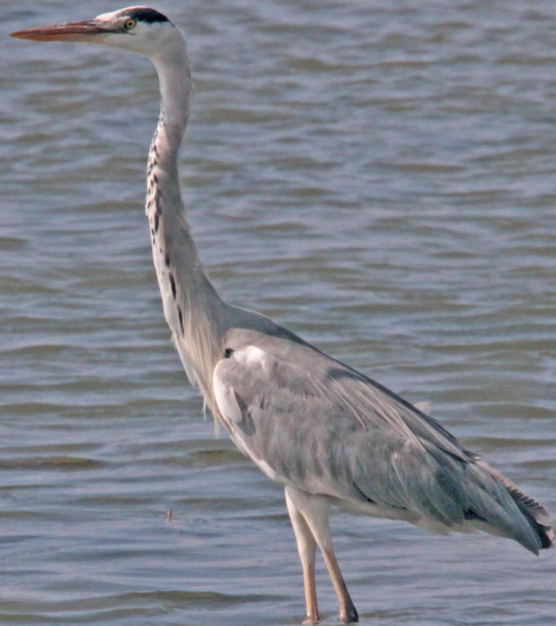
アオサギ(蒼鷺) サギ科 L=93cm