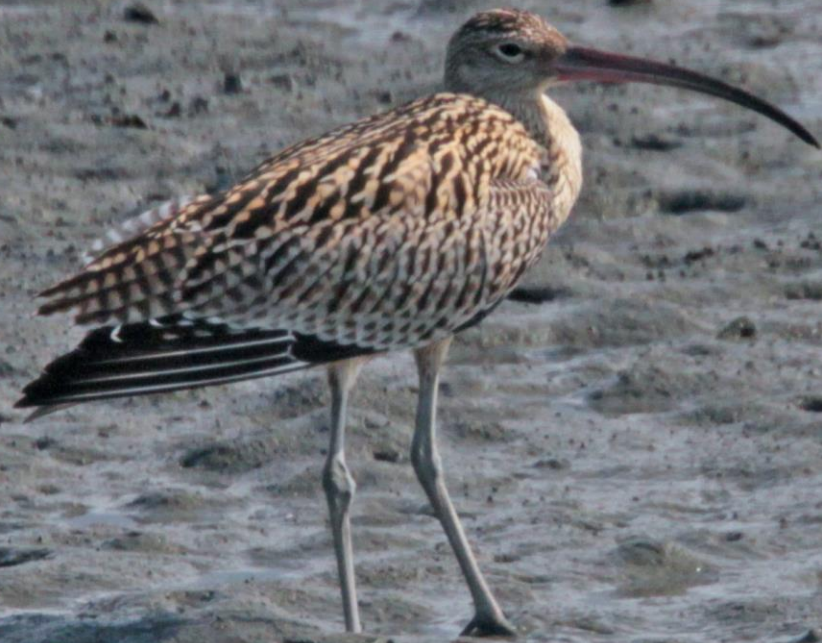
ホウロクシギ(培烙鷗) シギ科 L=63cm