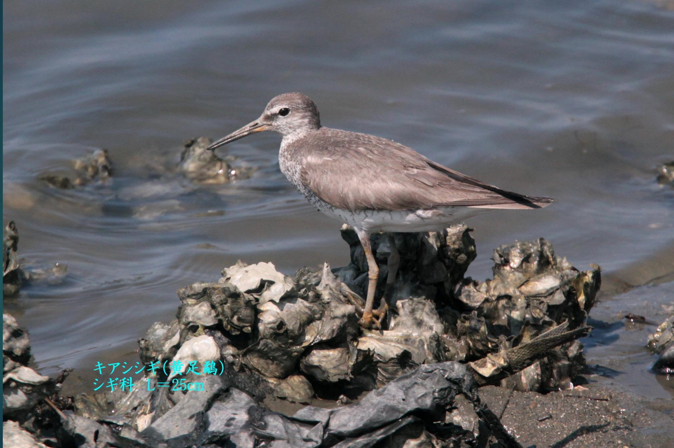
キアシシギ(黄足鷸) シギ科 L=25cm