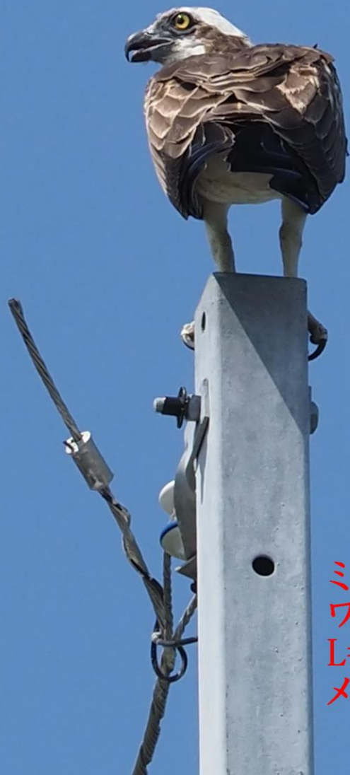
ミサゴ(鷲) ワシタカ科 L=オス54cm、 メス64cm