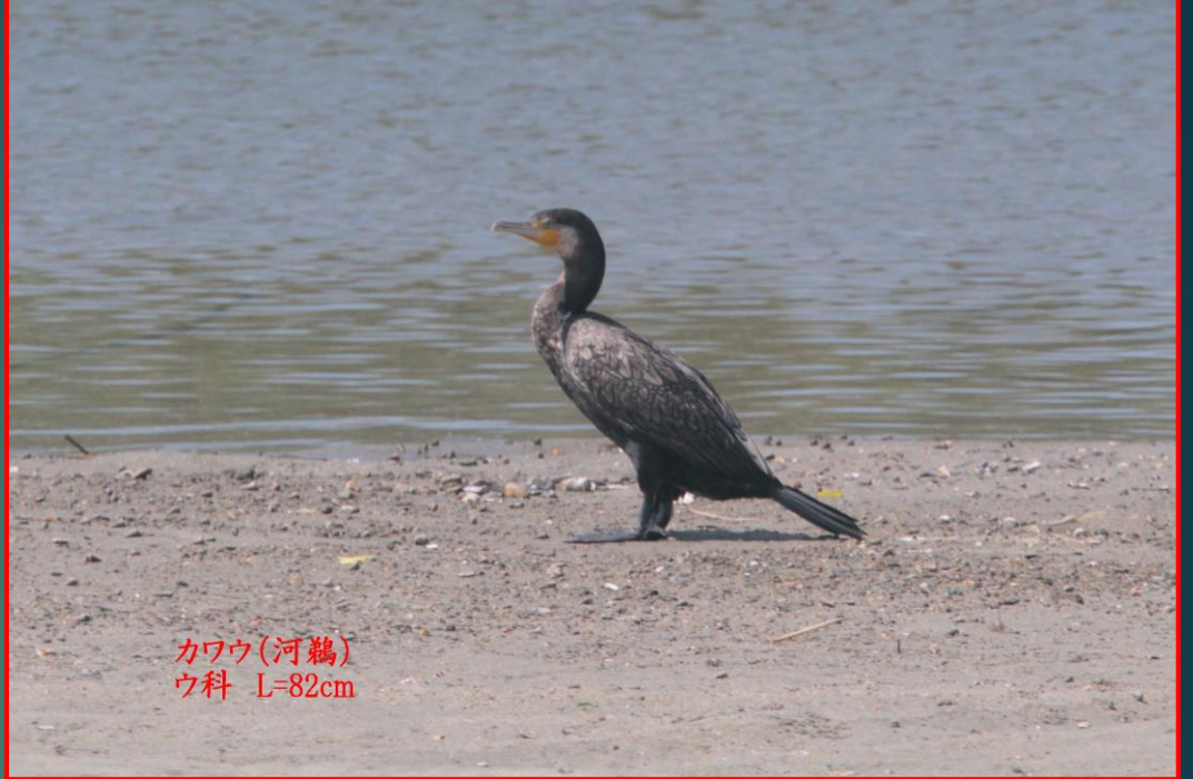
カワウ(河鵜) ウ科 L=82cm