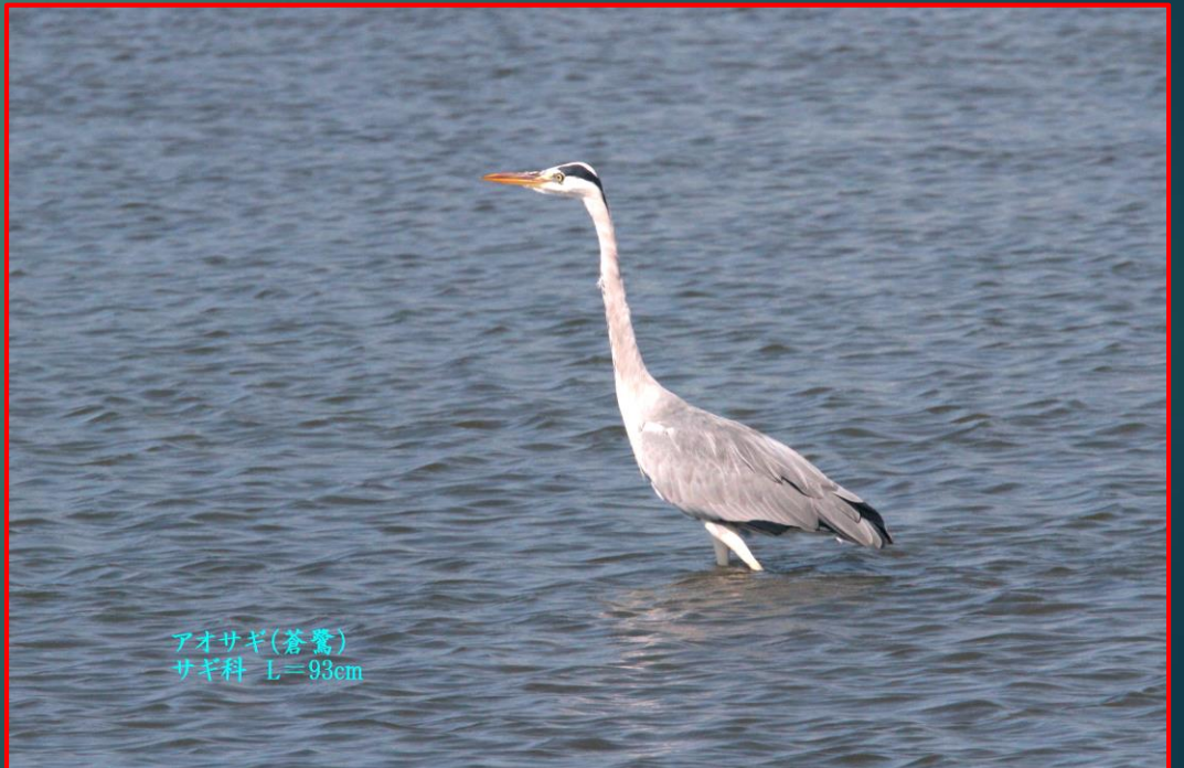
アオサギ(蒼鷺) サギ科 L=93cm