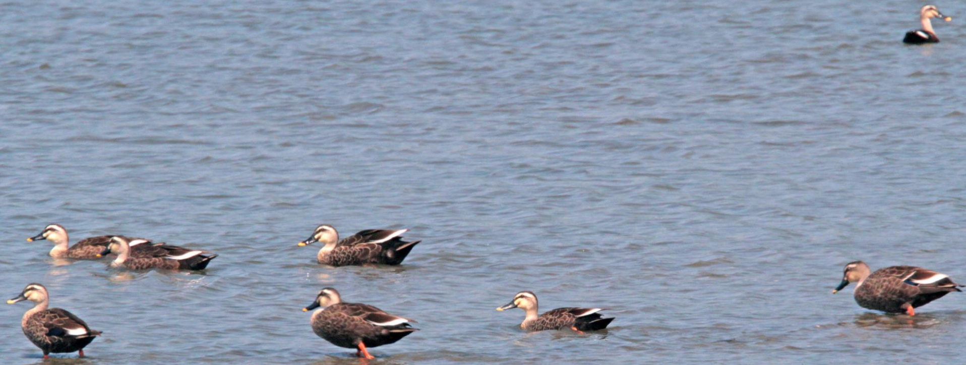
カルガモ(軽鴨) ガンカモ科 L=61cm