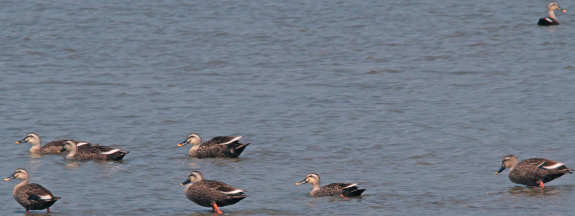
カルガモ(軽鴨) ガンカモ科 L=61cm