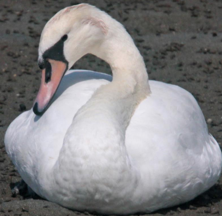
コブハクチョウ(瘤白鳥) ガンカモ科 L=152cm