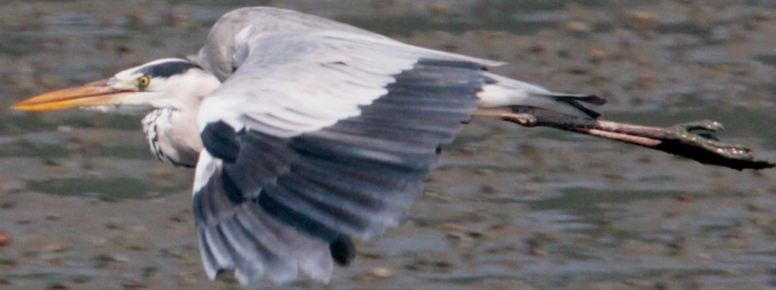
アオサギ(蒼鷺) サギ科 L=93cm