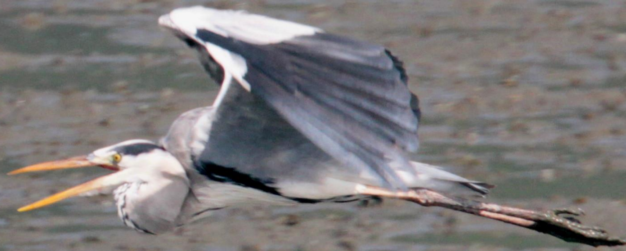
アオサギ(蒼鷺) サギ科 L=93cm