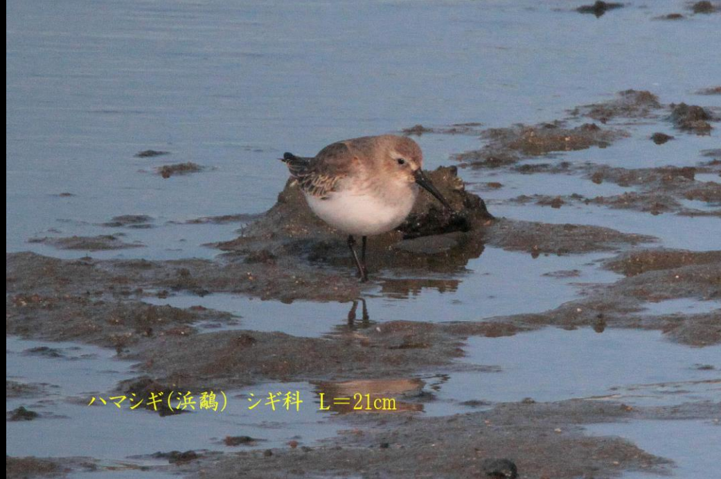
ハマシギ(浜鷺) シギ科 L=21cm