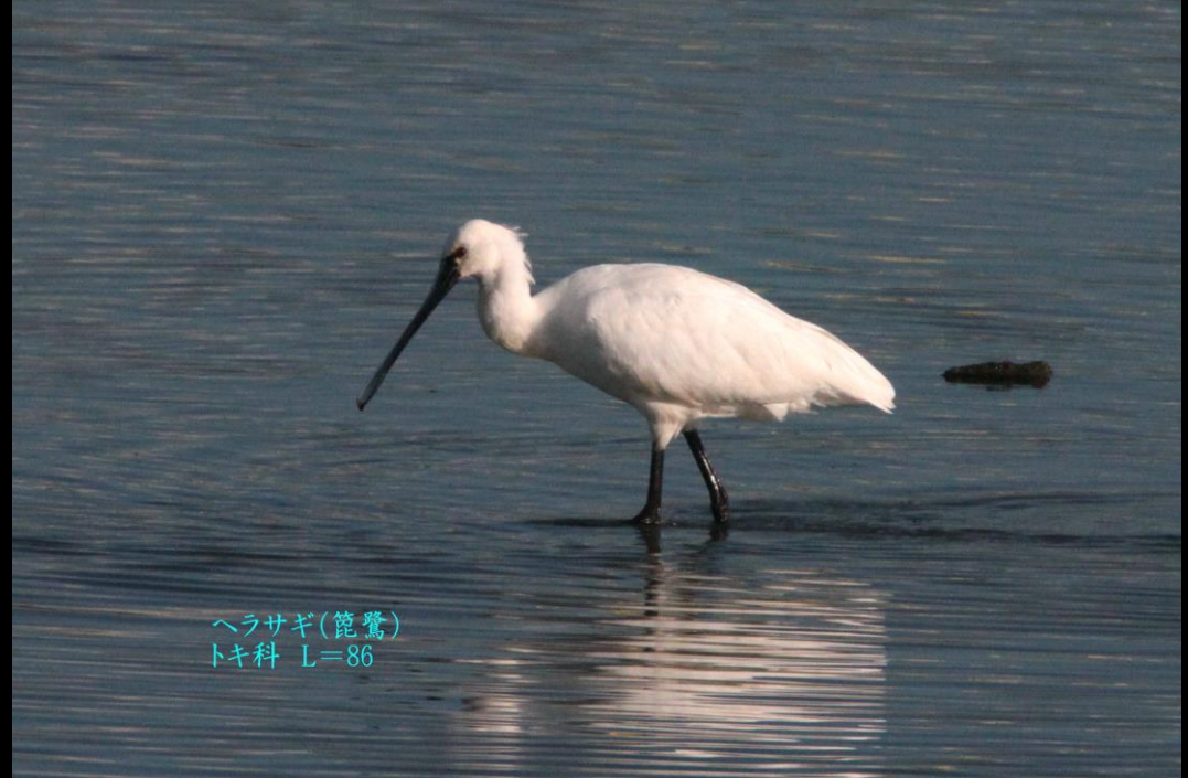
ヘラサギ(篋鷺) トキ科 L=86