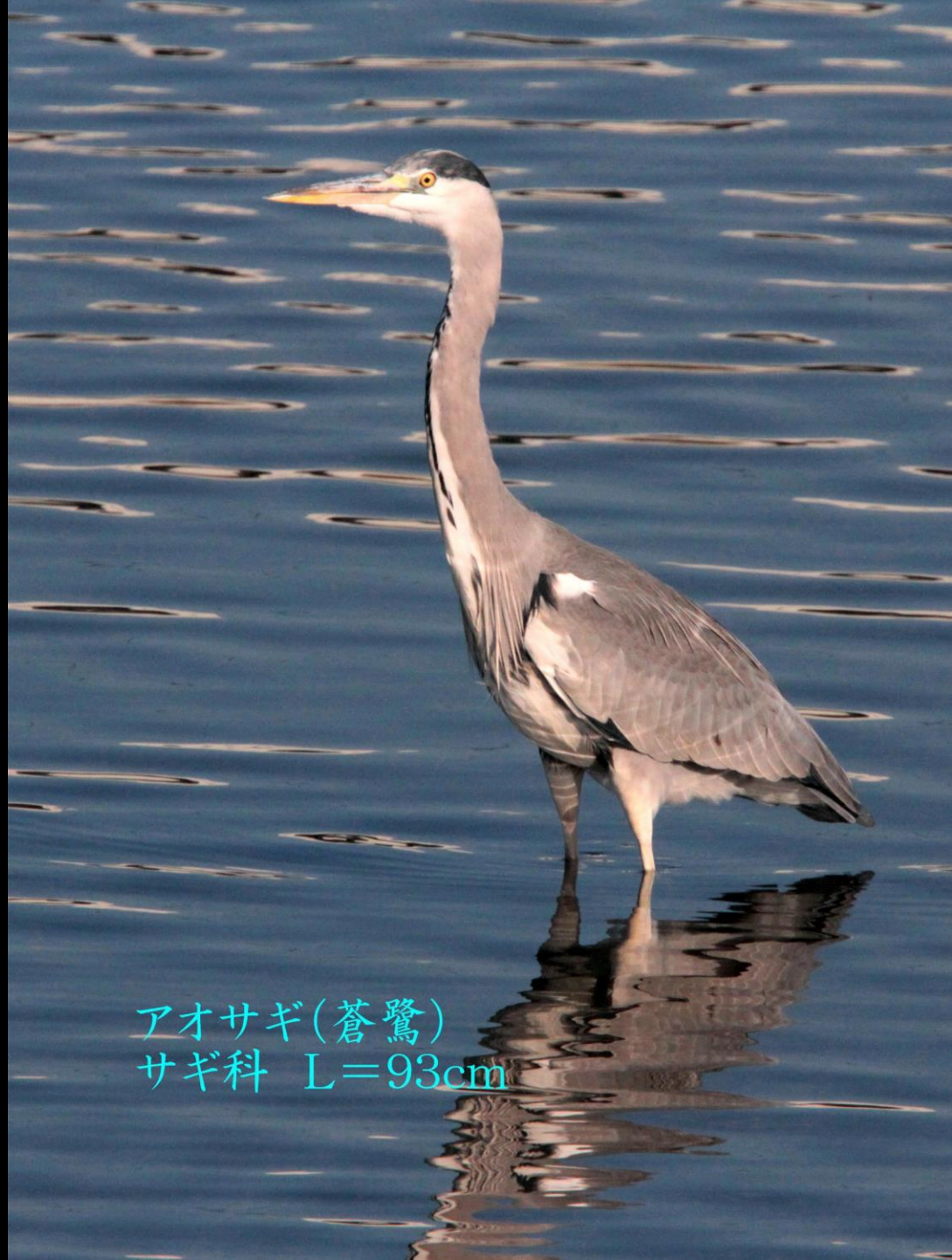
アオサギ(蒼鷺) サギ科 L=93cm