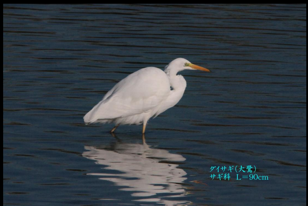
グイサギ(大鷺) サギ科 L=90cm