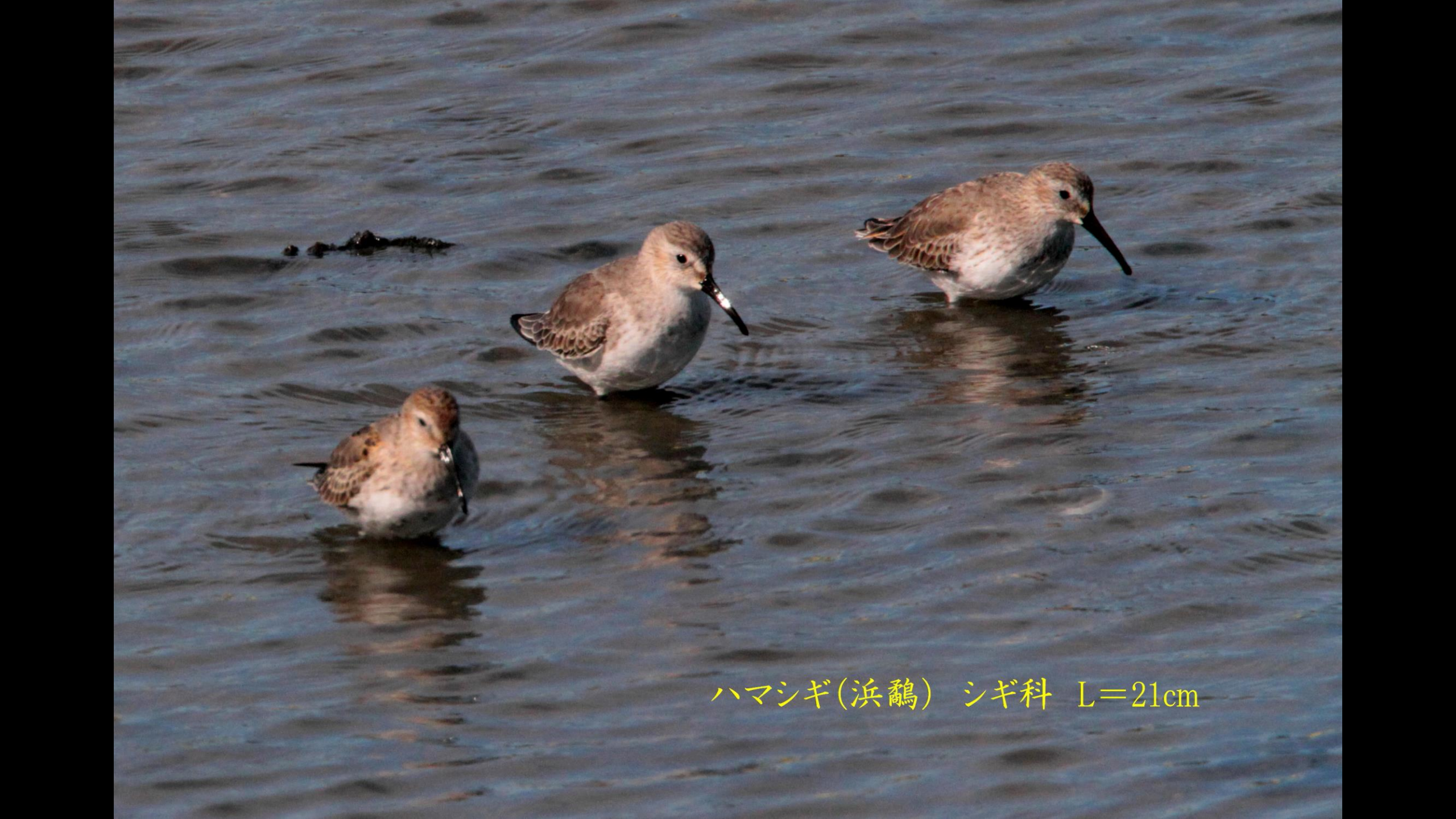
ハマシギ(滨鹬) シギ科 L=21cm