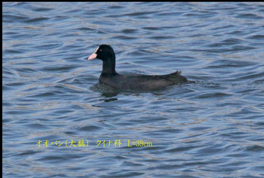
オオバン(大鵜) クイナ科 L=39cm