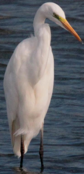
ダイサギ(大鷺) サギ科 L=90cm