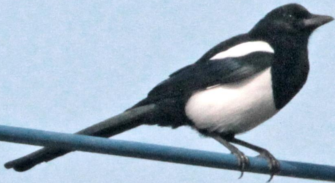
カササギ(鶺鴒) カラス科 L=45cm