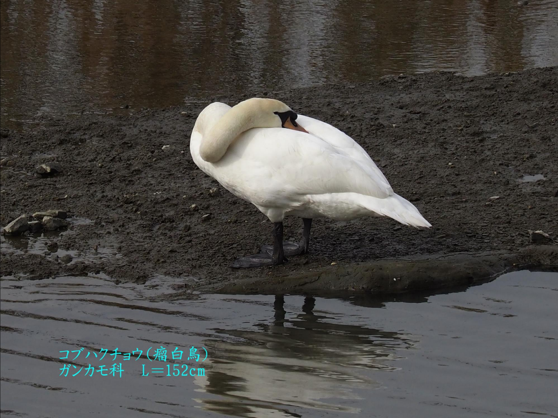
コブハクチョウ(瘤白鳥) ガンカモ科 L=152cm