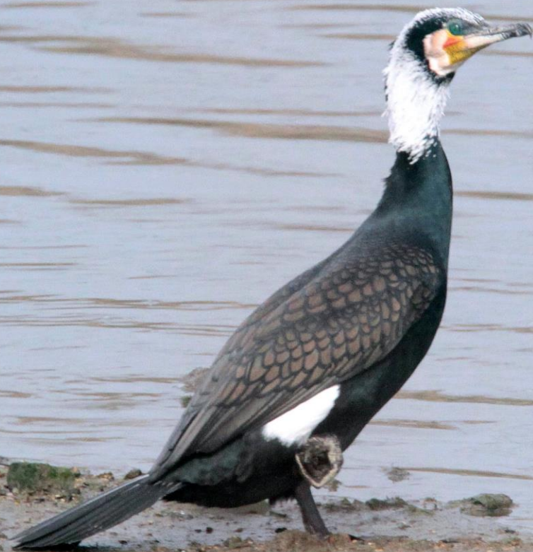
カワウ(河鵜) ウ科 L=82cm