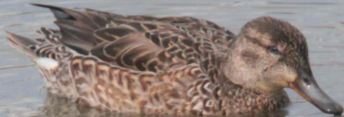
コガモ(小鴨)メス ガンカモ科 L=38cm