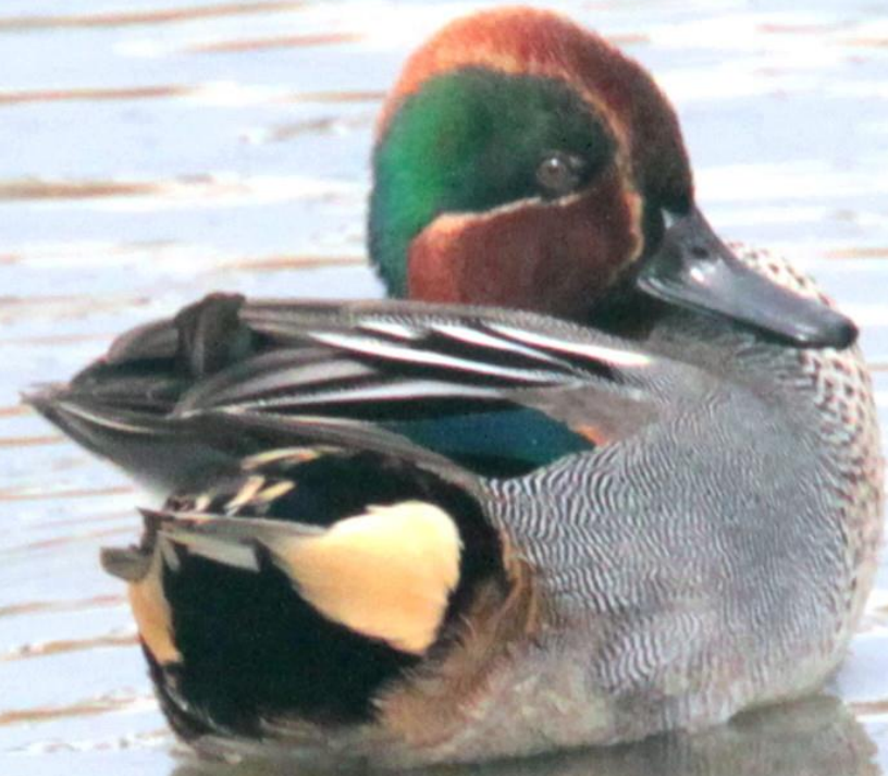
コガモ(小鴨)オス ガンカモ科 L=38cm