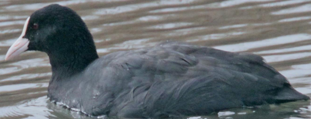
オオバン(大鵞) クイナ科 L=39cm