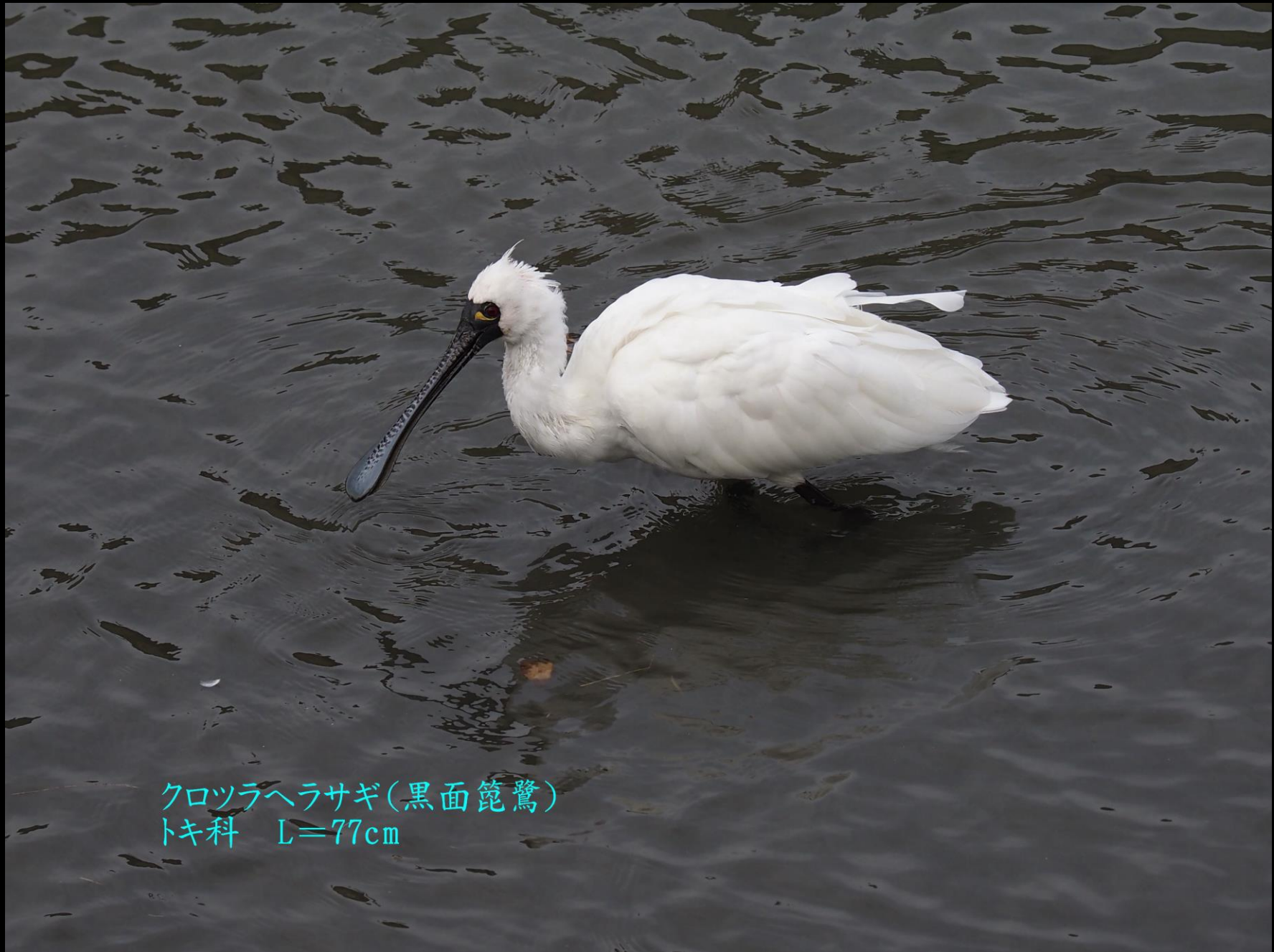
クロツラヘラサギ(黒面篋鷺) トキ科 L=77cm