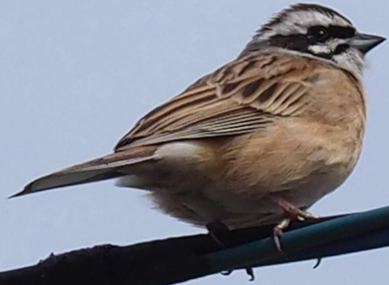
ホオジロ(頬白) ホオジロ科 L=16cm