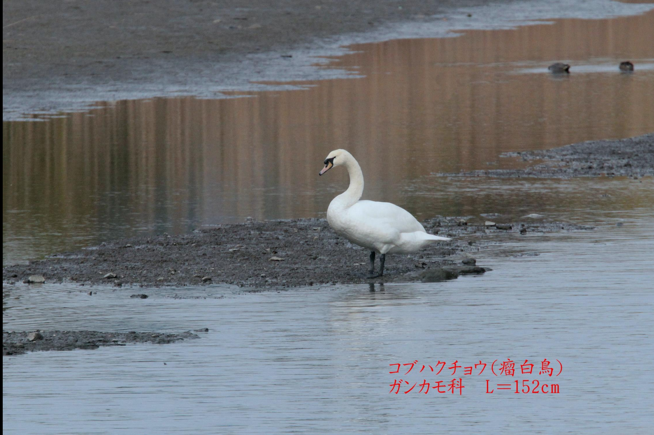
コブハクチョウ(瘤白鳥) ガンカモ科 L=152cm